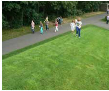
2008 Floriade Venlo ontwerp basispark Copijn tuin- en landschapsarchitecten Utrecht