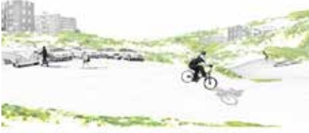
2012 De Hollandse Kustplaats, iov Atelier Kustkwaliteit