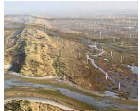
2008 Interaction between the elements Terschelling Rietveld Landscape Amsterdam