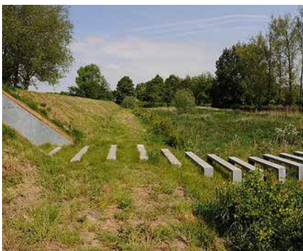
2006 Gedekte Gemeenschapsweg OKRA landschapsarchitecten Utrecht