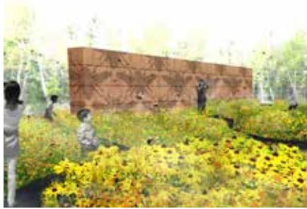
2013 BEEhaviour, Allariz Spanje, uitgevoerd, opgenomen in Jaarboek Landschapsarchitectuur en Stedenbouw 2013