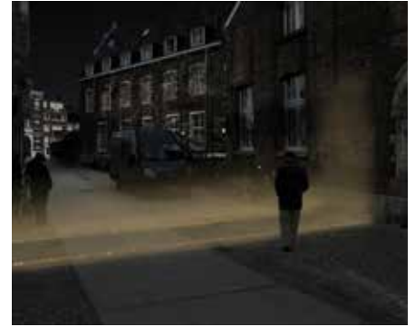
2016 Leuven Stadsomwalling, iov Gemeente Leuven