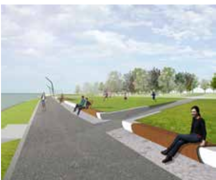
2011 Fuxin city park China Hosper landschapsarchitectuur en stedenbouw Haarlem ism Frontier Design architecten