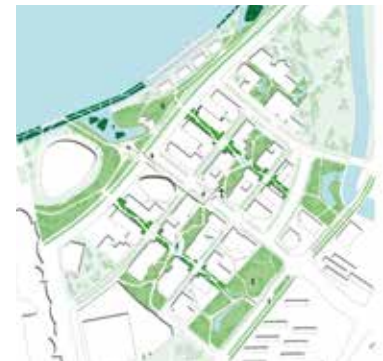
2015 Shanghai Greenways, Passages competition