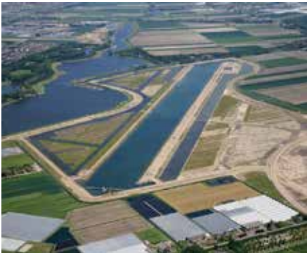
2007 Eendragtspolder Rotterdam Copijn tuin- en landschapsarchitecten Utrecht