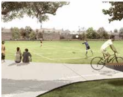
2015 Park ter Walle Menen, iov gemeente Menen