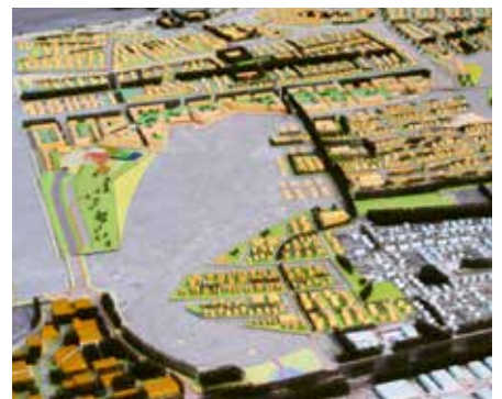
2010 Landschappelijk Raamwerk Waterrijk Almelo Hosper landschapsarchitectuur en stedenbouw Haarlem