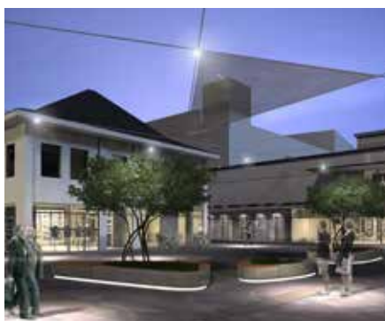
2011 Paderborn Königsplatz Hosper landschapsarchitectuur en stedenbouw Haarlem ism Foundation 5 architecten