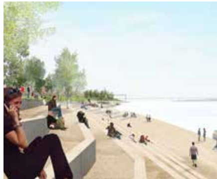
2009 Embankment Park Perm Rusland Hosper landschapsarchitectuur en stedenbouw Haarlem ism KCAP Rotterdam