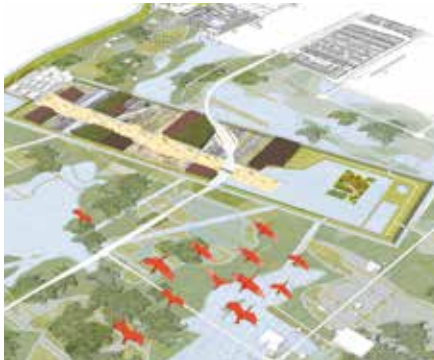
2007 Dredge Landscape Park, eerste prijs International Archiprix