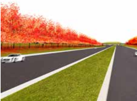
2011 Legacy of Olmsted, eervolle vermelding Montreal Gateway Competition