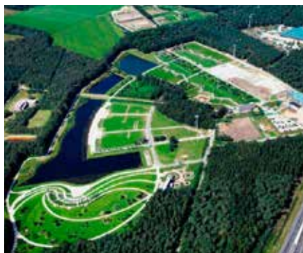
2008 Floriade Venlo ontwerp basispark Copijn tuin- en landschapsarchitecten Utrecht