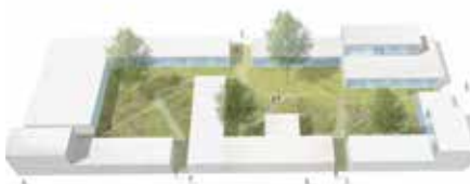
2015 Hof van Cartesius, stedenbouwkundig plan Utrecht