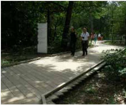
2008 Floriade Venlo ontwerp basispark Copijn tuin- en landschapsarchitecten Utrecht