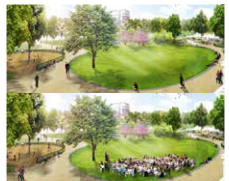
2010 Antwerpen Harmoniepark Hosper landschapsarchitectuur en stedenbouw Haarlem