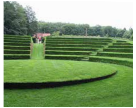
2008 Amfitheater Laag Oorspong Oosterbeek Copijn tuin- en landschapsarchitecten Utrecht