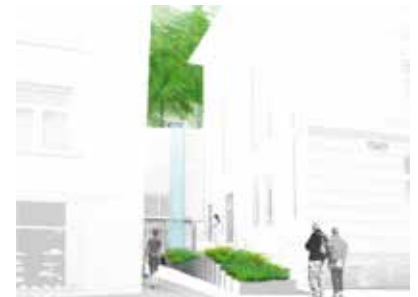
2013 Oasis Urbain, geselecteerd voor Lausanne Jardin Festival